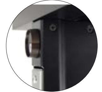
Installed Front view, Top Bracket with Lock Strike