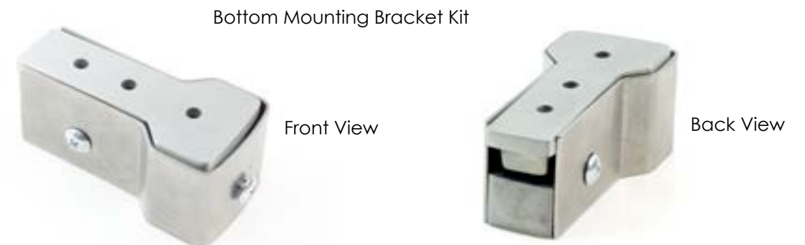
Bottom Mounting Bracket Kit