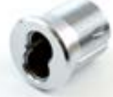
M100-IC Small Format Interchangeable Core Housing