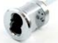
841-IC Small Format Interchangeable Core Housing